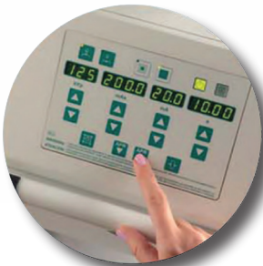
1 Region APR Console MEMBRANE