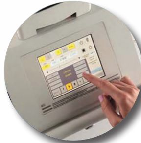
6 Region APR Console TOUCHSCREEN